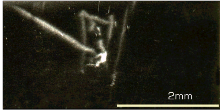
Figure 2. Autoradiography of charged particles tracks of beta delay isotopes on the surface palladium cathode. Some tracks of beta particles are paralleling the cathode surface.